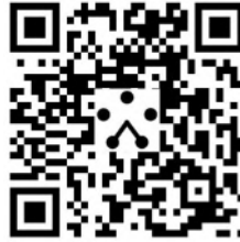
Australia Day Lunch Bookings

Booking via Trybooking CLICK HERE , or use the QR code: