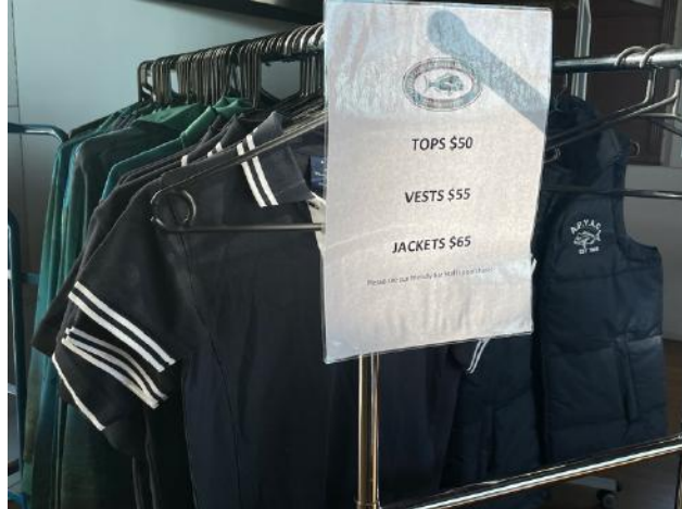
Grab an APYAC Jacket or Vest