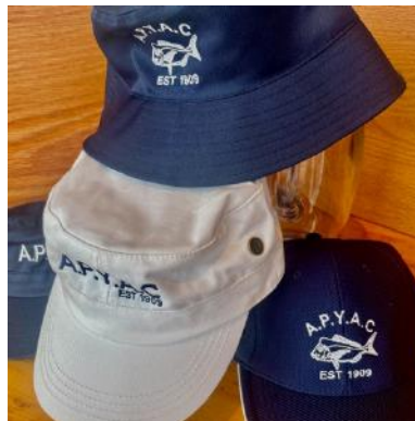
Grab a new APYAC hat - three styles!