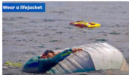
One of life's useless things: an unworn life jacket.

Life Saving Victoria revealed that eight in ten boating or fishing-related drowning deaths during the past decade involved incorrect, or no, lifejacket use.