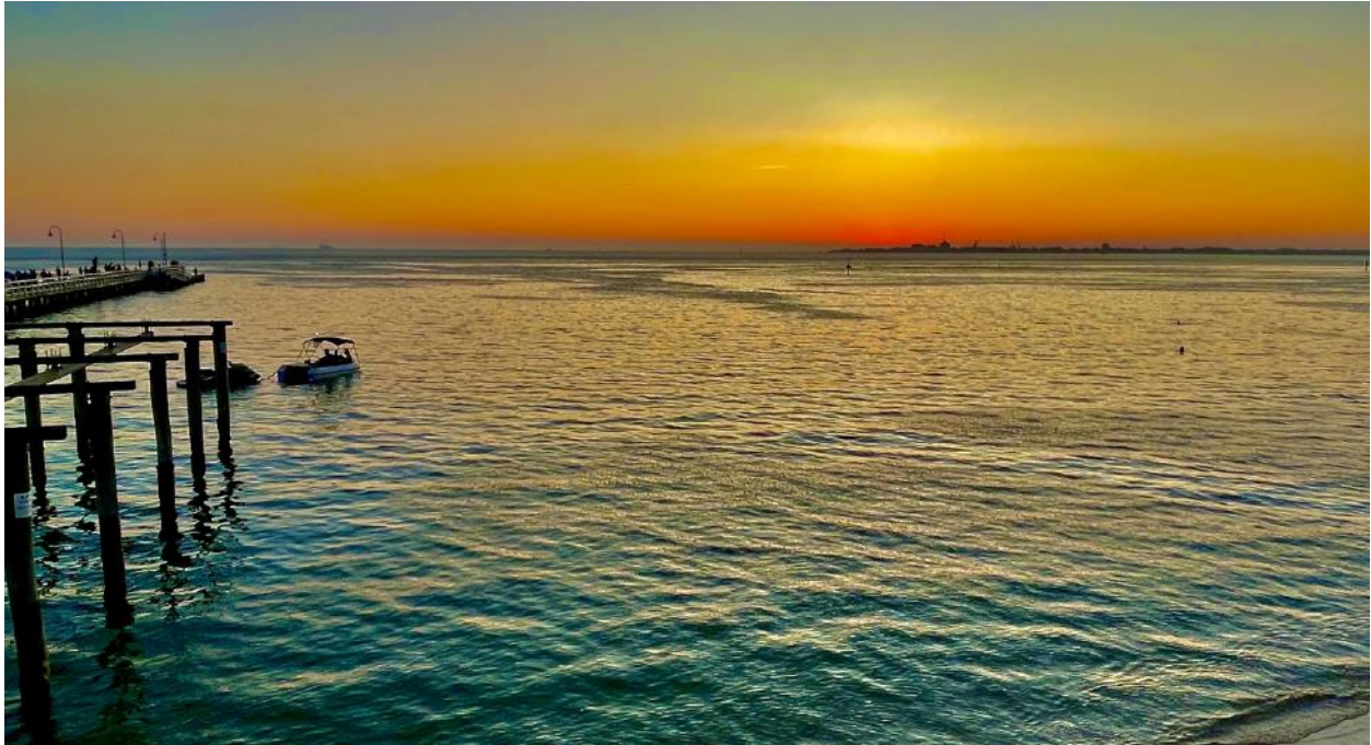
The wind on the water shows the approaching cool change