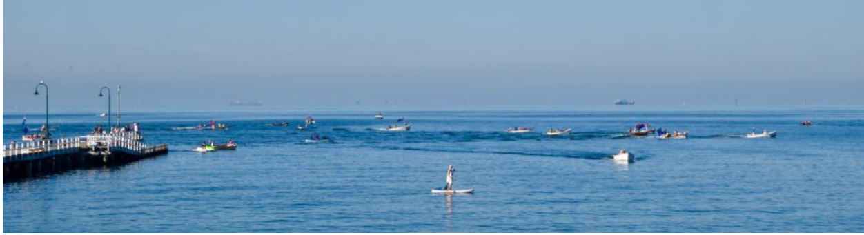
Last year's race gets underway.