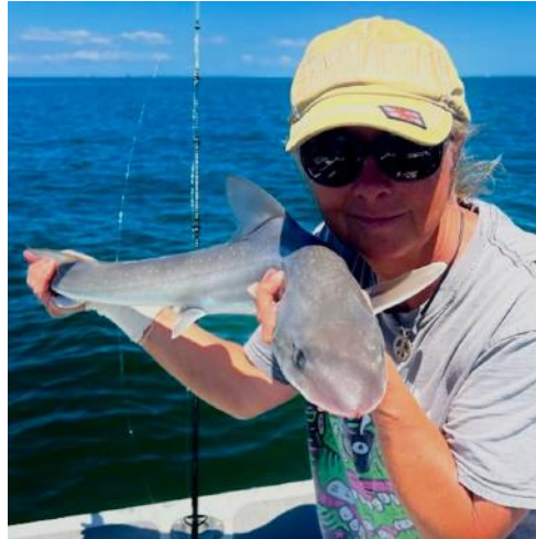
The President's 91cm Gummy Shark.