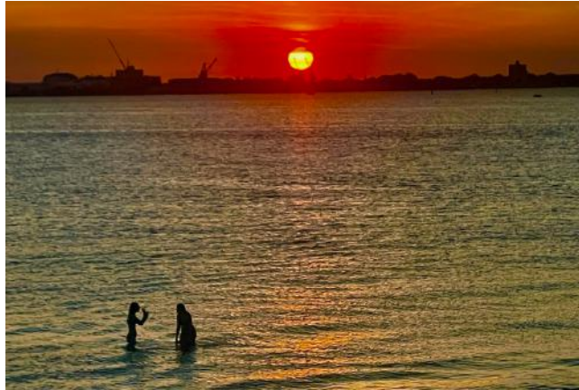
Cup Day - 29C with a glorious sunset.

The Club will be closed from Christmas Day, 25th December 2023 until (and including) 3rd January 2024 . Reopening: Thursday 4th January 2024 .