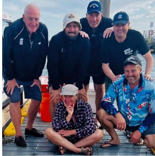
Lord Botham and John Emburey's last visit.