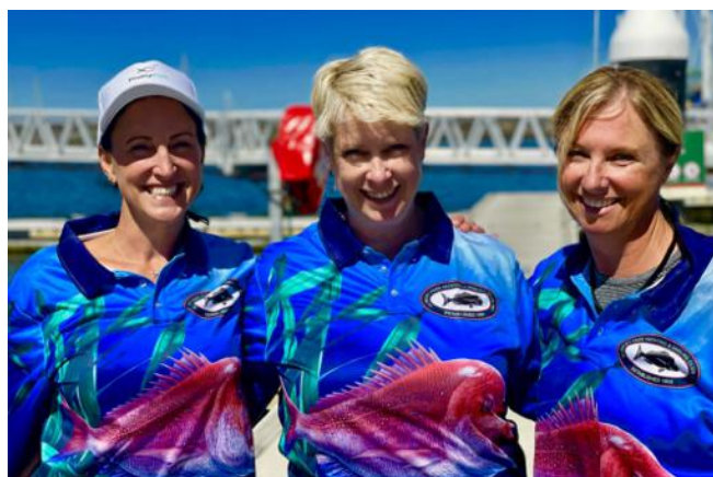
Spring into spring. Got your Fishing Top?