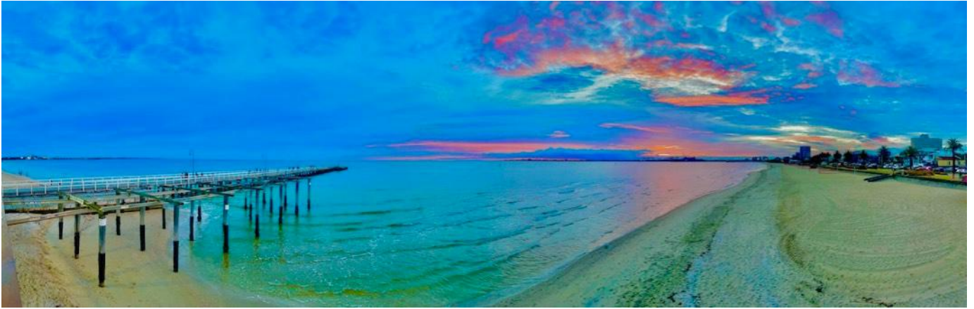
Last Friday night's spectacular sunset.