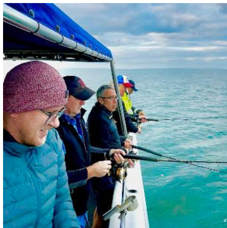
Feeding the Pinkies.