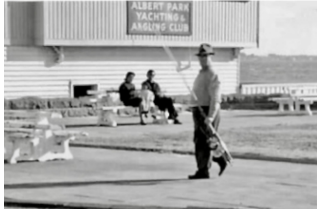
IMAGE: Thanks to the Emerald Hill Library & Heritage Centre and the City Of Port Phillip for this image 'from the '60s or '70's.