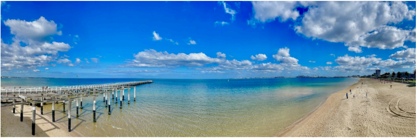
Last Saturday, in Albert Park with a strong offshore wind. we reached 21.6 degrees.