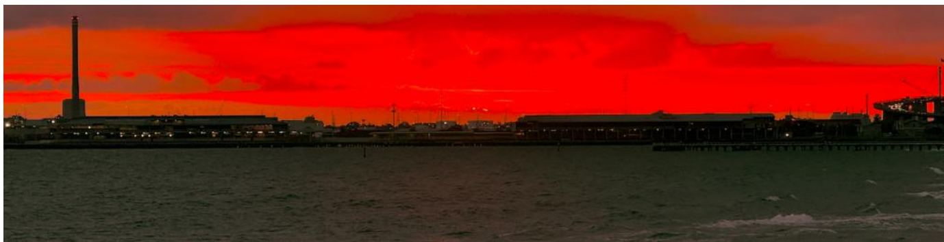
Shepherd's delight ... Anzac Day, Friday 25th April.