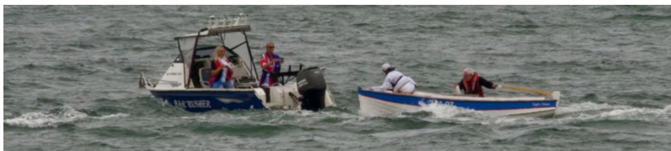
Australia Day 2025 Clinker Boat Race --fourth across the line!