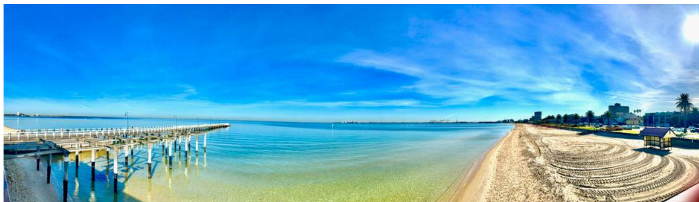
Winter solstice 12 noon

Admin is assisting with the booking process only.