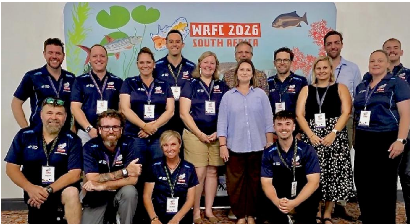
World Recreational Fishing Conference (WRFC) MPEKWENI BEACH RESORT, EASTERN CAPE, SOUTH AFRICA 22nd – 26th FEB 2026