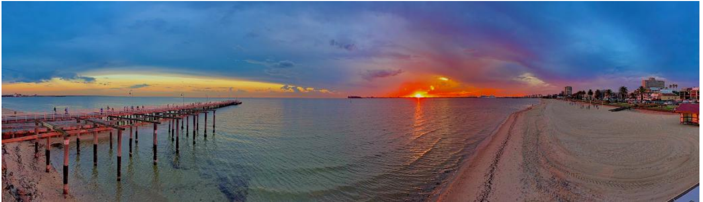
'Just finished another spin around my favourite star!' - Friday 27th February 2026.